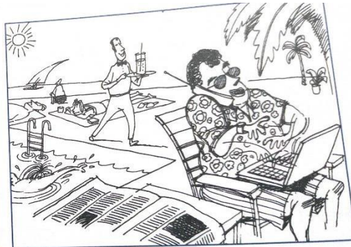
He works all the time—he never relaxes .

CHECK POINT. Check the best title for the cartoons.